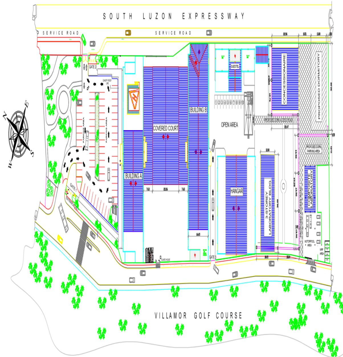
The Site Plan

[Insert here a list of Drawings. The actual Drawings, including site plans, should be attached to this section, or annexed in a separate folder.]